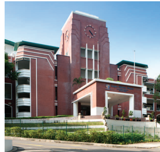
Anglo-Chinese School (Barker Road)