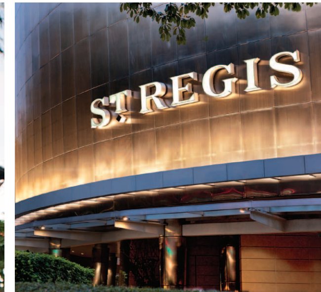
St. Regis Singapore

Enjoy a leisurely stroll at the Singapore Botanic Gardens on a Sunday afternoon? Or a private lunch with the family at the Tanglin Club, Shangri-La Hotel or The St. Regis Hotel? If it pleases your palate, you can be assured that it's close to home at GOODWOOD GRAND . Even your little ones have the best picks with Anglo-Chinese School, Raffles Girls' School and more prestigious educational institutions nearby.