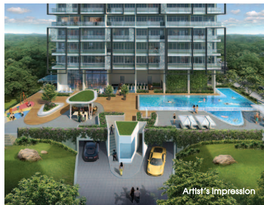
Three Balmoral Balmoral Road (Apartment)

The Tong Eng Group continues to blend creative planning and understated elegance while adopting new concepts and technology in developing buildings with enduring value. With each project, careful attention is paid to every detail, from redefining spaces to ensure the optimum layout, as well as providing only the most impeccable finishing and quality.