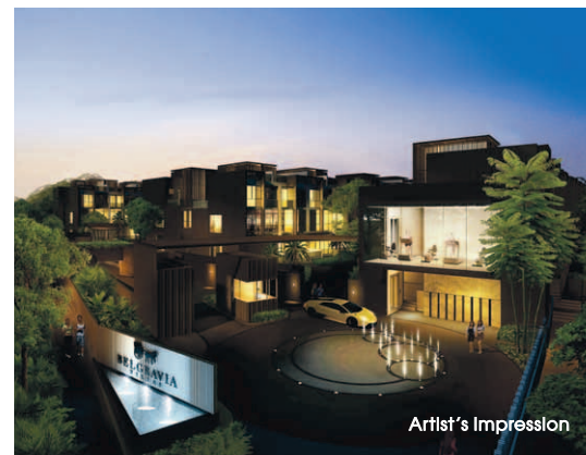
Belgravia Villas Belgravia Drive (Strata Housing)