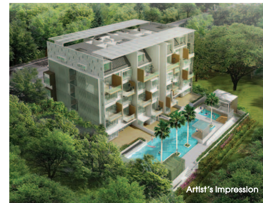
Balcon East Upper East Coast Road (Apartment)