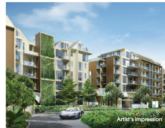
Tropika East Foo Kim Lin Road (Condominium)