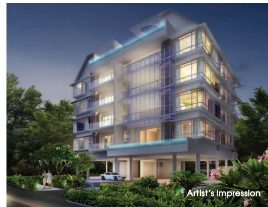
Herford Collection Herford Road (Apartment)