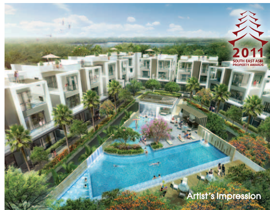
Poets Villas Tagore Ave (Strata Housing)